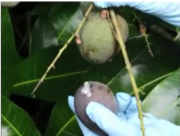
Video 1. Spray of latex at the point of stem attachment in mature, undamaged Mangifera casturi fruit when the fruit was detached from the stem (video). Video by G.T.M. The video is uploaded online as Supplementary material.

Mangifera spp which are documented to be suitable hosts of Bactrocera spp). Given that some of the Mangifera spp are good hosts for B dorsalis , we expect that there are additional, yet undocumented, B dorsalis hosts among others of the 69 Mangifera spp identified by Kostermans and Bompard. 2 It is, however, challenging to document the host status of many of the Mangifera spp. Mangifera spp tend to occur as scattered individuals at very low densities in tropical lowland rainforests. These widely scattered trees can be quite tall such that tree crowns, where fruits are present, can be rather inaccessible, resulting in Mangifera spp being poorly represented even in herbarium collections. An additional problem is that it is common for fruiting to occur only at intervals of 3 to 8 years. 4 As an