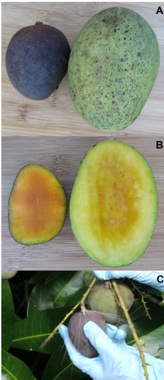
Figure 2. (A) Comparative appearance of mature, undamaged fruits: Mangifera casturi (left) and Mangifera lalijiwa (right). (B) Comparative appearance of pulp of mature fruits: M casturi (left) and M lalijiwa (right). (C) Spray of latex at the point of stem attachment in mature, undamaged M casturi fruit when the fruit is detached from the stem (frame from video [see Video 1]).

were identified to species based on counts of numbers of lobes in the prothoracic spiracles. 8