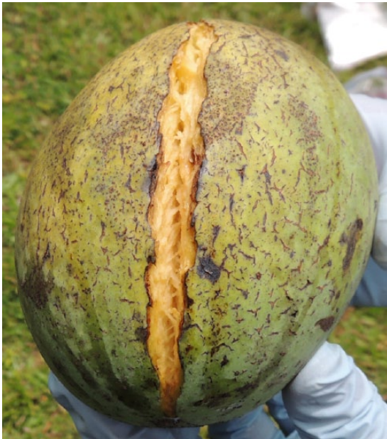
Figure 4. Ripe, cracked, infested M lalijiwa fruit harvested from the tree. A total of 35 Bactrocera dorsalis larvae were present in this 0.499 kg fruit, from which 18 males and 8 females emerged.