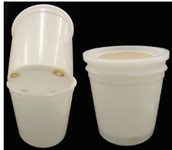
Figure 3. Plastic buckets used for holding fruits for assessment of infestation by tephritid fruit flies. The picture on the left shows the screened bottom holes on the top bucket that permitted the draining of fluids from the fruit to prevent drowning of any infesting tephritid fruit fly larvae. The picture on the right shows the screen on the lid of the top bucket and the buckets as stacked together.

Averages were calculated for weights of fruits collected and numbers of fruit flies recovered per kg fruit and per kg infested fruit. Percentage infestation was calculated based on total number of fruits collected. Oriental fruit fly, Bactrocera dorsalis (Hendel), catch per trap per day was calculated each week for traps in the M casturi and M lalijiwa trees.