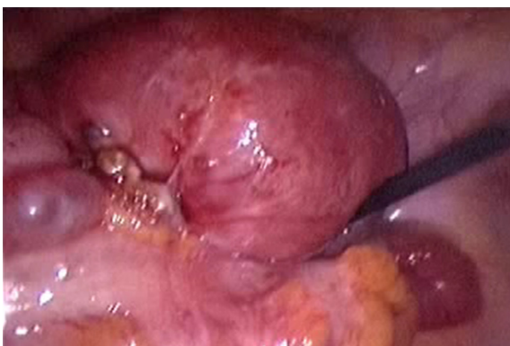
Figure 2. The firm adhesences of the genital tract internal to the rest of pelvic organs are frequent, as in this case the sigma (called frozen pelvis ).

Severe endometriosis was defined according to the revised American Fertility Society classification stage IV. Acting as